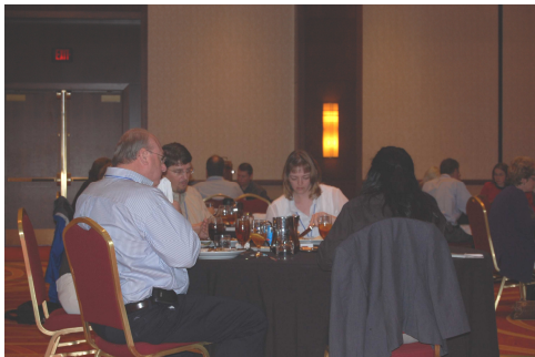
Above: PMI Members enjoying lunch