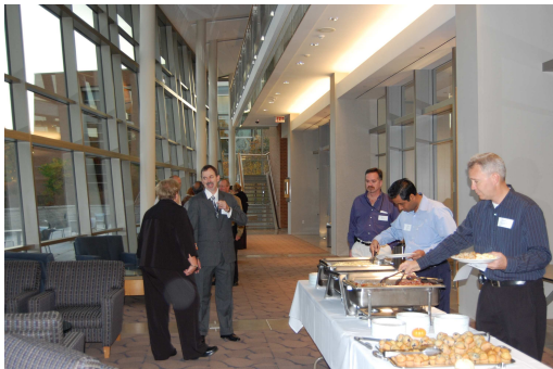
Left: PMI members enjoy the breakfast buffet at ACT.