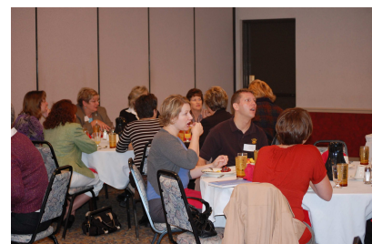
Above: PMI Members attending the September meeting.