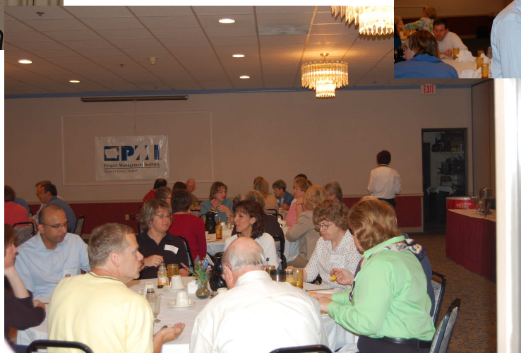
PMI members enjoying breakfast at the June meeting.